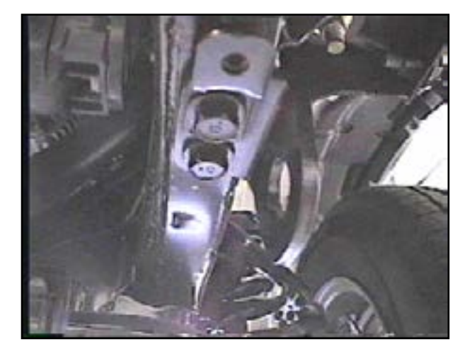
1. Remove the four metric bolts from factory tie down brackets with 17MM socket. Factory tie down brackets will not be reinstalled.

Tie down brackets are remove and not reinstalled for baseplate installation. There is NO drilling. The attachment tabs are centered at 24 inches and at 11 inches height.